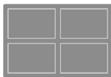
MIHBS 36W 1D 24H