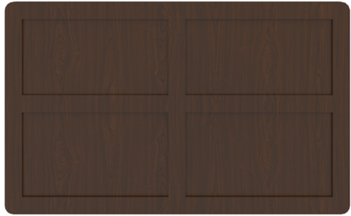
Model: MIHBS 36W 1D 24H

Time-honored crafting and practical concerns blend to produce refined, functional furniture. OG edging and gently radiused corners add understated touches of distinction to these water- and scuff-resistant, fire-retardant products. Choose from dozens of hardware styles, including ADA-compliant.