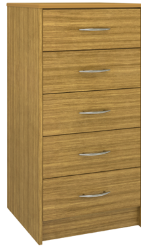
Model: ATCH50 24.25W 18.5D 46.75H

The Atlanta Collection features softly rounded edges and waterfall detailing. Transitional styling make this ideally suited for a wide range of environments. Choose from dozens of hardware styles, including ADA-compliant and soft pulls. Atlanta is customizable and available in various sizes to suit your space. The product is required to be wall mounted for safety. Using the kit provided, please follow provided instructions exactly.