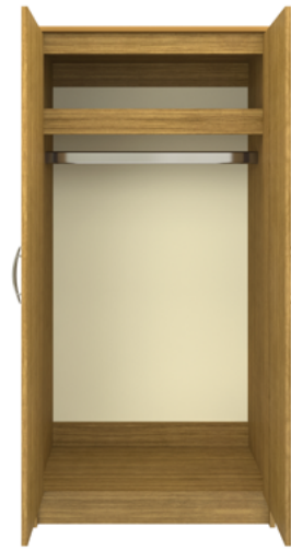
Model: ATWRO2 34.75W 23D 71H

The Atlanta Collection features softly rounded edges and waterfall detailing. Transitional styling make this ideally suited for a wide range of environments. Choose from dozens of hardware styles, including ADA-compliant and soft pulls. Atlanta is customizable and available in various sizes to suit your space. The product is required to be wall mounted for safety. Using the kit provided, please follow provided instructions exactly.