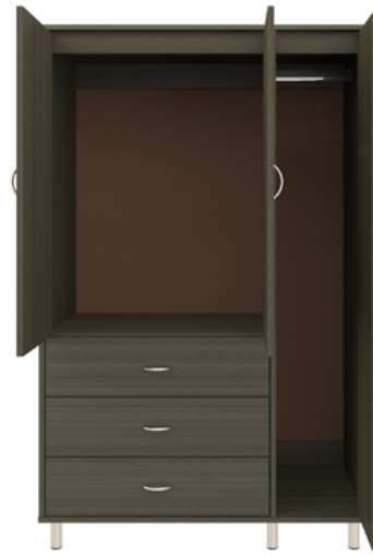
Model: A2AW33R 45W 23D 71H

Taking on a new twist from an old classic, the Atlanta II re-invents itself by adding feet for a wonderful new design with tried and true appeal. Cleaning and maintenance are simple and easy when case goods are elevated. Available with or without contrasting edges as well as custom color combinations. The product is required to be wall mounted for safety. Using the kit provided, please follow provided instructions exactly.