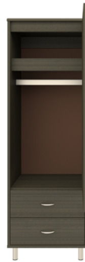
Model: A2WR21R 23.75W 23D 71H

Taking on a new twist from an old classic, the Atlanta II re-invents itself by adding feet for a wonderful new design with tried and true appeal. Cleaning and maintenance are simple and easy when case goods are elevated. Available with or without contrasting edges as well as custom color combinations. The product is required to be wall mounted for safety. Using the kit provided, please follow provided instructions exactly.