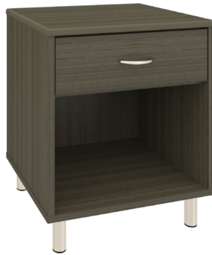
Model: A2NS10 21.25W 18.25D 25H

Taking on a new twist from an old classic, the Atlanta II re-invents itself by adding feet for a wonderful new design with tried and true appeal. Cleaning and maintenance are simple and easy when case goods are elevated. Available with or without contrasting edges as well as custom color combinations.