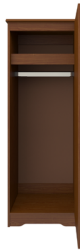
Model: LAWRO1R 25W 23.75D 71H

The Lancaster Collection offers unobtrusive refinement and skilled craftsmanship to form the perfect balance between function and beauty. Rich OG detailing on the tops and recessed insert panels set into chamfered frames on doors and drawers. Collection available with or without contrasting edges as well as custom color combinations. The product is required to be wall mounted for safety. Using the kit provided, please follow provided instructions exactly.