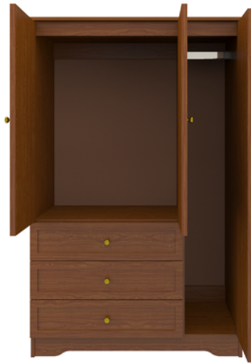
Model: LAAW33R 45.5W 23.75D 71H

The Lancaster Collection offers unobtrusive refinement and skilled craftsmanship to form the perfect balance between function and beauty. Rich OG detailing on the tops and recessed insert panels set into chamfered frames on doors and drawers. Collection available with or without contrasting edges as well as custom color combinations. The product is required to be wall mounted for safety. Using the kit provided, please follow provided instructions exactly.