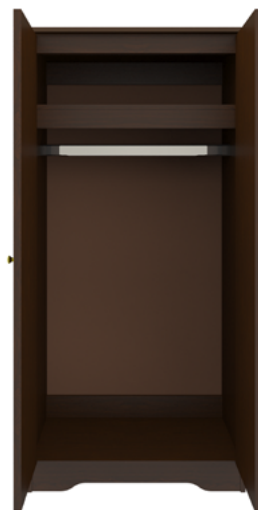
Model: MIWRO2 34.5W 23.75D 71H

Time-honored crafting and practical concerns blend to produce refined, functional furniture. OG edging and gently radiused corners add understated touches of distinction to these water- and scuff-resistant, fire-retardant products. Choose from dozens of hardware styles, including ADA-compliant. The product is required to be wall mounted for safety. Using the kit provided, please follow provided instructions exactly.