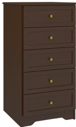
Model: MICH50 25W 19D 46.75H

Time-honored crafting and practical concerns blend to produce refined, functional furniture. OG edging and gently radiused corners add understated touches of distinction to these water- and scuff-resistant, fire-retardant products. Choose from dozens of hardware styles, including ADA-compliant. The product is required to be wall mounted for safety. Using the kit provided, please follow provided instructions exactly.