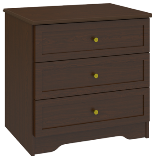
Model: MICH30W 31.5W 19D 30H

Time-honored crafting and practical concerns blend to produce refined, functional furniture. OG edging and gently radiused corners add understated touches of distinction to these water- and scuff-resistant, fire-retardant products. Choose from dozens of hardware styles, including ADA-compliant. The product is required to be wall mounted for safety. Using the kit provided, please follow provided instructions exactly.