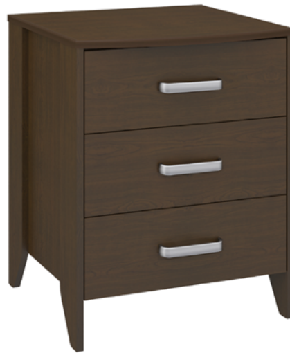
Model: EXCH30 24.75W 20D 30H

The contemporary Essex collection features a distinctive leg design providing a dimensional look that allows for easy cleaning. Select tone-on-tone or contrasting wood-grained finishes for legs and top. Customizable and available in a variety of sizes. Sophisticated hardware delivers added style. The product is required to be wall mounted for safety. Using the kit provided, please follow provided instructions exactly.