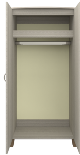
Model: LBWR02 34.75W 23D 71H

Refreshing as the sea air its name represents, the streamlined Long Beach Collection's dual-toned look is the perfect match for any décor. Long Beach features chamfered side frames and front overlay design; extended tops provide additional space. The distinctive leg design has stylish dimensional appeal. The product is required to be wall mounted for safety. Using the kit provided, please follow provided instructions exactly.