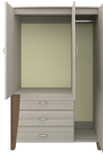
Model: LBAW33R 45W 23.25D 71H

Refreshing as the sea air its name represents, the streamlined Long Beach Collection's dual-toned look is the perfect match for any décor. Long Beach features chamfered side frames and front overlay design; extended tops provide additional space. The distinctive leg design has stylish dimensional appeal. The product is required to be wall mounted for safety. Using the kit provided, please follow provided instructions exactly.