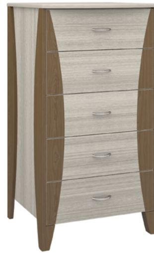
Model: LBCH50 24.25W 20D 46.75H

Refreshing as the sea air its name represents, the streamlined Long Beach Collection's dual-toned look is the perfect match for any décor. Long Beach features chamfered side frames and front overlay design; extended tops provide additional space. The distinctive leg design has stylish dimensional appeal. The product is required to be wall mounted for safety. Using the kit provided, please follow provided instructions exactly.