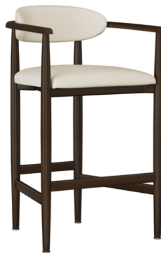
Model: APNOSTLB11 23.25W 22.5D 39.5H 20SW 18SD 29.5SH 36.5AH

The frames of the Arpino Bar and Counter Stools are made of the coveted, highly cleanable, and award-winning Kwalu Classic material. The design creates curved arms that flow to the back and form straight tapered legs. A second back band adds style and the functionality of a hand grip. Complete with footrests, side stretchers, a cushioned chair back, and a removable and replaceable cushioned seat, the Arpino stools provide peace of mind, comfort, and style.