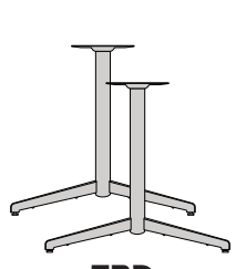
TBD T-Base Double