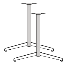
WH Wheelchair Height (30.5")