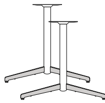
31 31in footspread