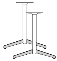
26 26in footspread