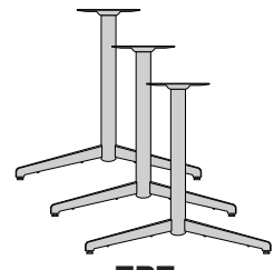
TBT T-Base Triple