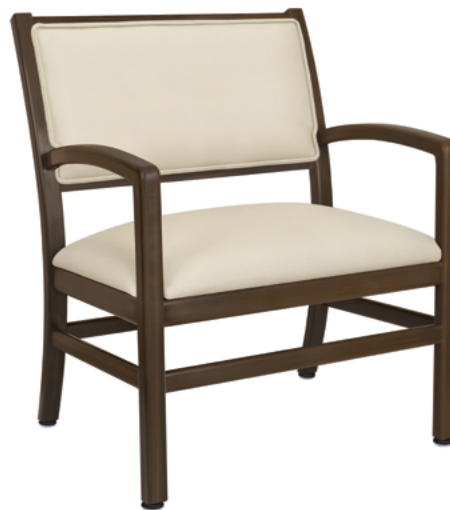
Model: TRABO 28.75W 24D 36H 25.25SW 19SD 19SH 26AH

Kwalu's Trava Bariatric Dining Chair redefines comfort and style for every diner, designed with generous proportions. Designed to reflect the morphology and ergonomics specific to bariatric needs, this model incorporates Kwalu's Designed to Last® engineering and endures the most rigorous testing standards to provide supreme strength and safety for each user.