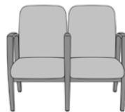
VLGC 45.5W 29.5D 37H 26AH