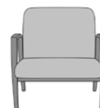
VLGJ 34.25W 29.5D 37H 26AH