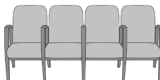
VLGG 89W 29.5D 37H 26AH