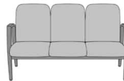
VLGD 63W 29.5D 37H 26AH