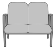
VLGB 43.5W 29.5D 37H 26AH