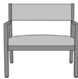
CTEB21 34W 24.5D 33.75H 25AH