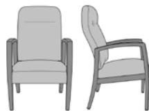
VLR02 24W 25.5D 40H 26AH