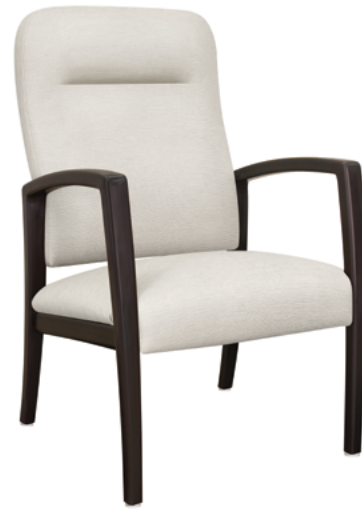
Model: VLR02 24W 25.5D 40H 20SW 19SD 19SH 26AH

Heralding style and comfort, the sleek Valentia features modern lines and curves with traditional support. Angled, contemporary arms provide aesthetic appeal and facilitate ingress and egress. The supreme quality of the cushioned seat and the reassurance of the ergonomically designed back create the ultimate place to relax.