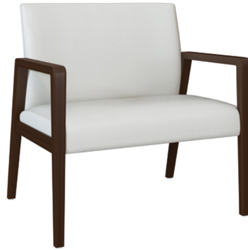
Model: VLDFIXB34G 34W 27D 35H 30SW 19SD 19SH 26AH

Kwalu's Valdina Bariatric chair redefines comfort and style for every lounge, lobby or waiting room guest. Built for maximum stability and strength, utilizing our steel reinforced joint system, this thoughtfully designed chair accommodates generous proportions and is available in two back heights. The chair back extends to the seat rail and the cleanout is incorporated behind the seat cushion providing a clean, functional look.