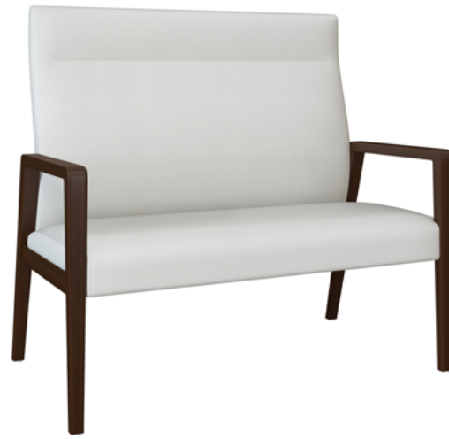
Model: VLDFIXB46P 46W 27.5D 43H 42SW 19SD 19SH 26AH

In any healthcare setting where two would like to sit comfortably together, the Valdina Bariatric – 46W Tall Back is a beautiful solution. The single back and seat cushion are just wide enough for a parent and small child. Built for maximum stability and strength, utilizing our steel reinforced joint system, this thoughtfully designed chair is available in two back heights. The chair back extends to the seat rail and the cleanout is incorporated behind the seat cushion providing a clean, functional look.