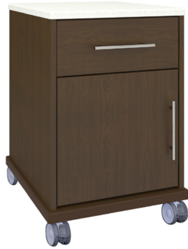
Model: AUBS11HCCTL 21W 19D 30H

Kwalu's Auburn Mobile Cabinet with Corian® top is designed exclusively for the healthcare market. The Auburn is a flawless blend of form and function. The cabinet base design is made of thicker panels for stability. Gently rounded corners and tops with a 3/8" edge banding and bullnose profile eliminate sharp edges. Styles included a 1 door, 1 drawer and a three drawer; both with 3" twin wheel front locking Tente casters. Drawer liners and Corian® top are optional. This product is designed for personal items and supplies. It is not intended for clothing storage.