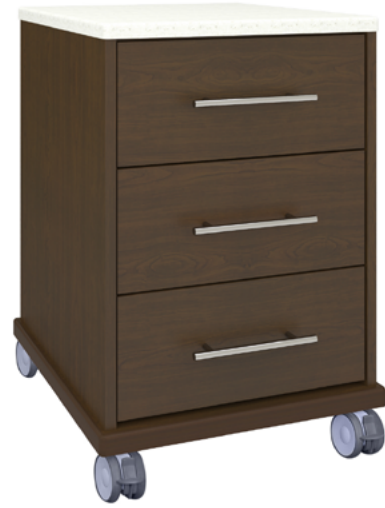
Model: AUBS30HCCT 21W 19D 30H

Kwalu's Auburn Mobile Cabinet with Corian® top is designed exclusively for the healthcare market. The Auburn is a flawless blend of form and function. The cabinet base design is made of thicker panels for stability. Gently rounded corners and tops with a 3/8" edge banding and bullnose profile eliminate sharp edges. Styles included a 1 door, 1 drawer and a three drawer; both with 3" twin wheel front locking Tente casters. Drawer liners and Corian® top are optional. This product is designed for personal items and supplies. It is not intended for clothing storage.