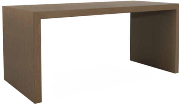
Model: LECOTBLC8436A 84W 36D 36H

The Lecco tables are completed constructed of easily cleaned and maintained Kwalu laminate material on steel reinforced frames. Lecco is available in multiple sizes and two heights, bar and counter height. An optional power grommet is centered on the tabletop and accommodates 2 power outlets and 2 USB ports. A magnetically attached panel is removable to access wires.