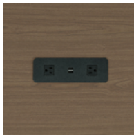
Table ships fully assembled.