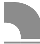
MDALKTLBAD 29W 29D 15H