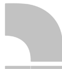
MDALKTLBBD 29W 29D 15H