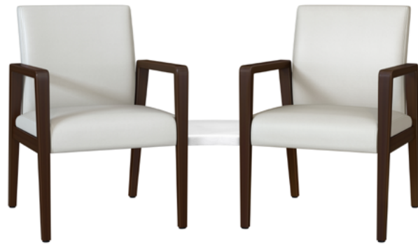
Model: VDNLKTBLBE (Also displayed with two VLDFIXG11. Not included.) 25.25W 20.75D 1.5H

Kwalu Linking Tables add a level of functionality placed inline and in corners between guest and bariatric seating models. Choose square, rectangular, and wedge-shaped tables for visitors to place devices and other items in healthcare wait spaces. The Valdina Wedge is available with optional rounded corners.