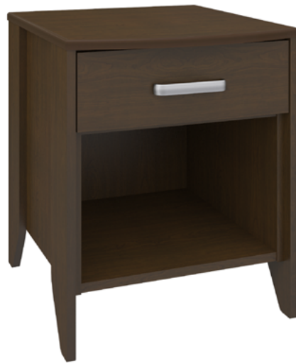
Model: EXNS10 21.25W 19.25D 25H

The contemporary Essex collection features a distinctive leg design providing a dimensional look that allows for easy cleaning. Select tone-on-tone or contrasting wood-grained finishes for legs and top. Customizable and available in a variety of sizes. Sophisticated hardware delivers added style.